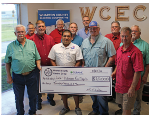
Danevang Volunteer Fire Department