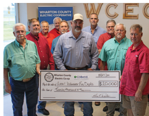
Garwood Volunteer Fire Department