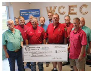
El Campo Volunteer Fire Department