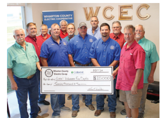
Louise Volunteer Fire Department